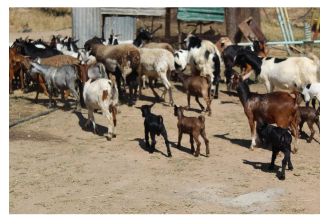
This depends on what your goals is