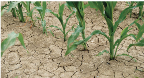
Figure 2 Sorghum plants with intact green leaves under drought