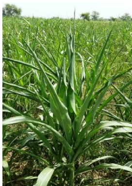
Figure 4 The leaves of sorghum roll under high temeperature conditions in order to prevent water loss due to high traspiration rate

Leaves the broad leaves of sorghum are important for maximizing photosynthetic capacity of the plant, however the leaf roll trait is very important to reduce transpiration rate under incidental high temperature conditions.