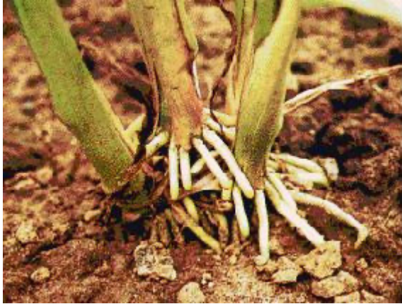
Figure 3 secondary roots of Sorghu

Floating of basal roots, secondary roots in response to flooding is one morphological attribute that enhances sorghum varieties tolerance to flooding and waterlogging. Floating of these roots enables the roots to access oxygen and respire. Under flooded conditions the roots become more fibrous in nature.