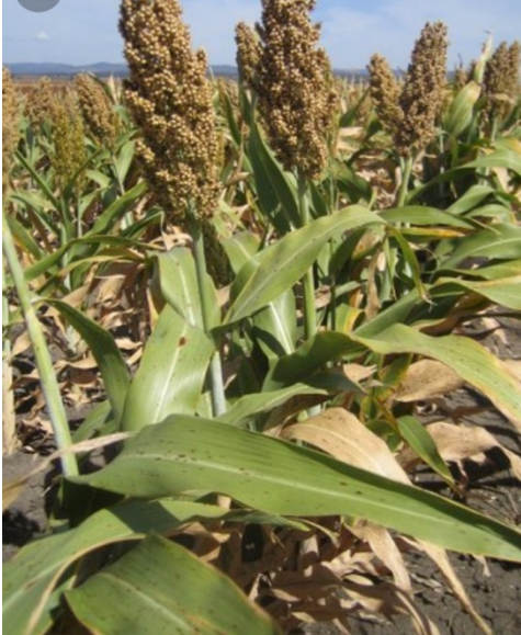
Figure 1 sorghum plants with reduced number of green leaves due to drought. the lower leaves have started to dry out.